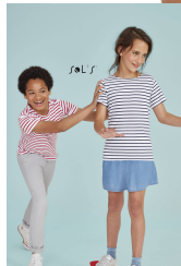
MILES KIDS 01400