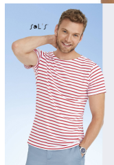
MILES MEN 01398