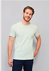
SOL'S MARTIN MEN 02855