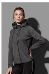
ST5940 Recycled Scuba Jacket